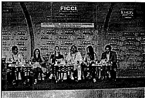
Panellists on the dais Click on the image to enlarge

Beginning the discussion, Gandhi stated that the consumption of media in India has drastically changed in the past five years; today's generation could only understand brands like Google, You Tube, Facebook and Twitter and the language of uploading, tagging, commenting and updating status. He added that reality shows were popular because the maximum viewership came from the youth. Also, the price of a smart phone was less than $100.